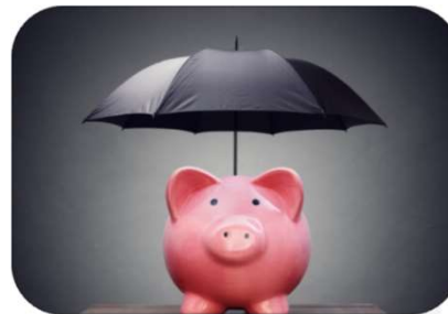
Long-term Fiscal Challenges